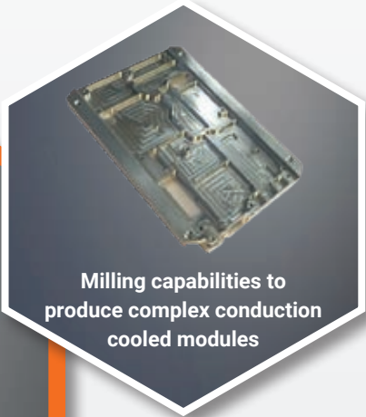
Milling capabilities to produce complex conduction cooled modules