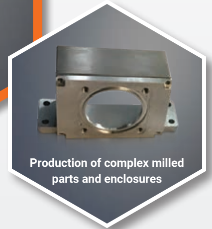
Production of complex milled parts and enclosures