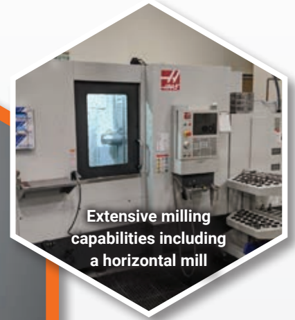
Extensive milling capabilities including a horizontal mill