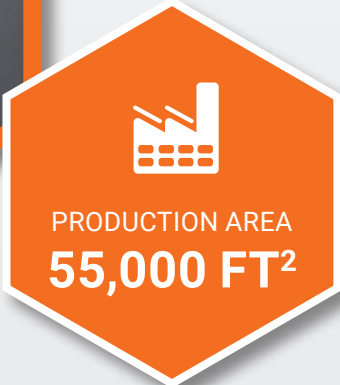
PRODUCTION AREA 55,000 FT 2