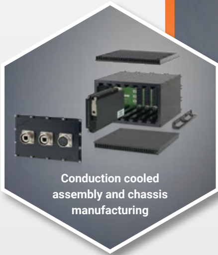
Conduction cooled assembly and chassis manufacturing